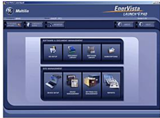
GE Multilin Relay 469 Simulator