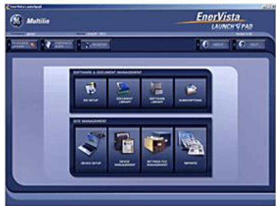
GE Multilin Relay 750 Simulator