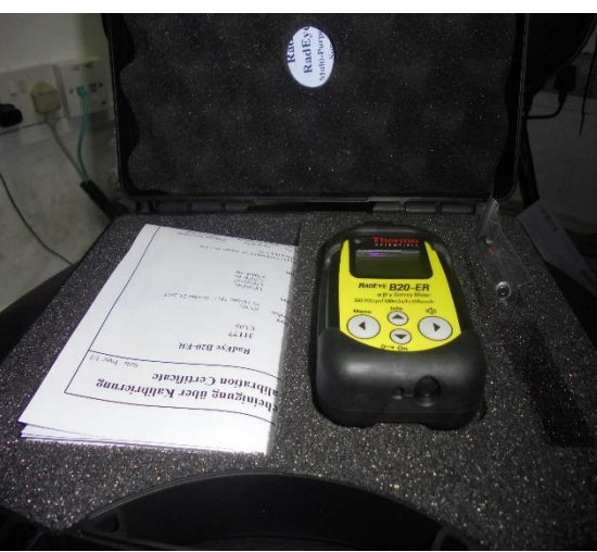
Thermo Scientific RadEye B20-ER Model