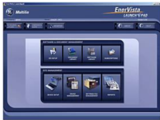
GE Multilin Relay 750 Simulator