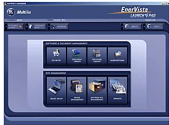
GE Multilin Relay 469 Simulator